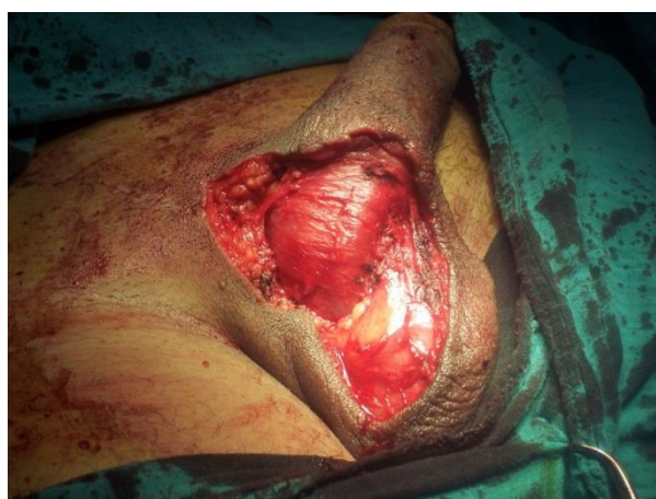
Fig-3: Right hemiscrototomy