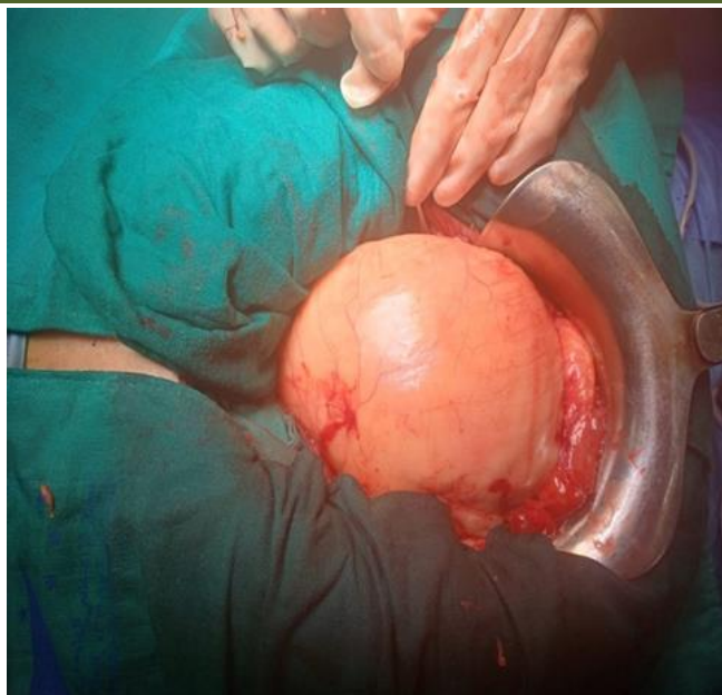
Figure 2: Intraoperative image of the lipoma