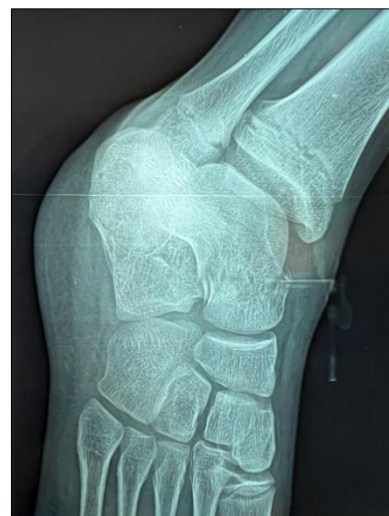
Figure 1: Standard ankle X-ray showing talus fracture

The evolution was good with a 12-month follow-up, without any morphological or functional complications.