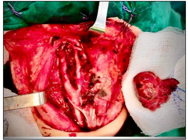
Figure 2: Right carotid body tumor measuring approximately 4x5 centimeters in diameter, hypervascularized, completely surrounding the internal and external carotid arteries, and also surrounding the hypoglossal nerve (Shamblin III)

Daysi Alejandra León Sanguano et al, SAS J Surg, Feb, 2024; 10(2): 143-147