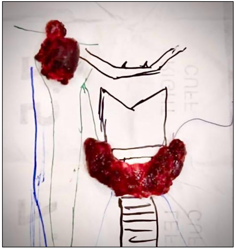
Figure 3: A. Right carotid body tumor measuring approximately 4x5 centimeters in diameter. B. Enlarged thyroid gland with bilateral nodules

The patient was discharged after 48 hours with no signs of hypocalcemia, no neurological deficits, no alteration in voice tonality with adequate pain control and tolerating diet. The pathological study indicated a follicular variant and classic multifocal papillary thyroid carcinoma at the bilateral level of the gland in addition to the carotid glomus. Patient remains under control for thyroid cancer without hypocalcemia, without