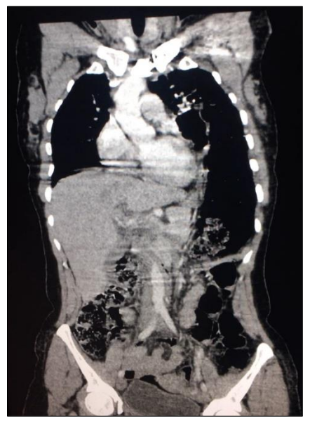
Figure 2: Thoraco-abdominal CT showing the ascension of intra-thoracic organs