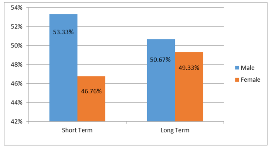
Figure 1: Sex distribution in study sample

Table 2 shows that out of 75 patients who received short-term 3 dose prophylactic antibiotics, only 5 developed SSI postoperatively. Overall infection rate was 6.67%. Choledocholithotomy shows the maximum number of infection (16.67%) among different type of clean-contaminated surgery probably most choledocholithiasis patients present with Obstructive Jaundice and jaundiced patient are immune