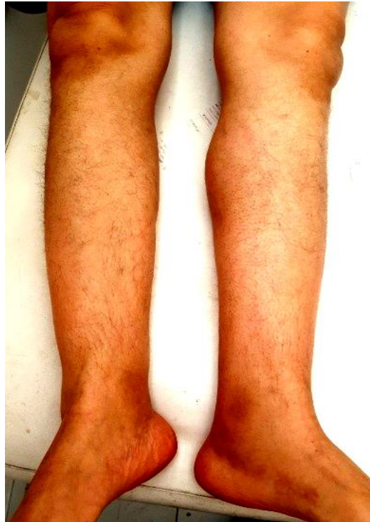
Figure 1: Asymmetry of both calves with redness

Ultrasound revealed a deep collection adjacent to the muscles of the posteromedial section of the upper 1/3 of the left leg, heterogeneous, well-limited and thick-walled, measuring 52×20mm [20mm from the skin],