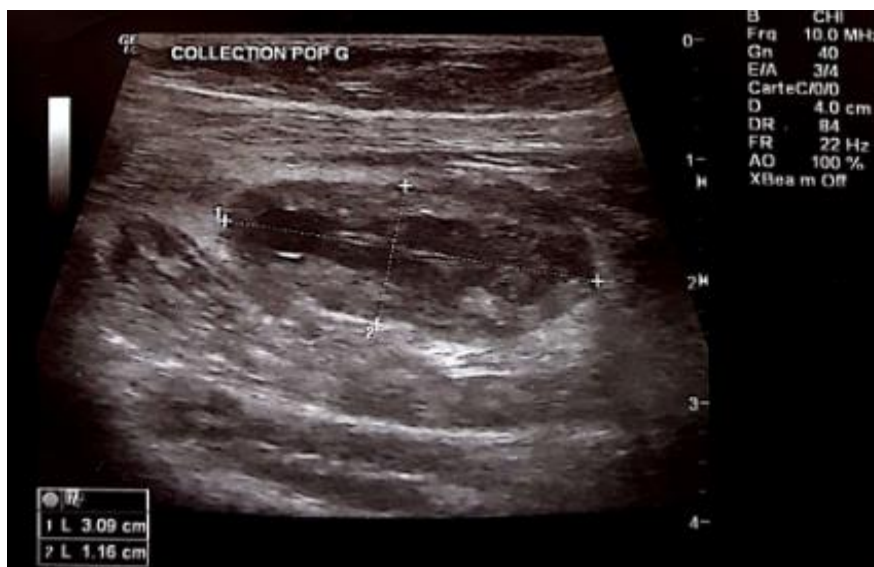
Figure 2: Deep collection in the muscles of the posteromedial section of the upper third of the leg, revealed by ultrasound

associated with thickening of the skin [12mm] and infiltration of subcutaneous fat, probably related to an abscess of the posteromedial side of the leg (Fig 2).