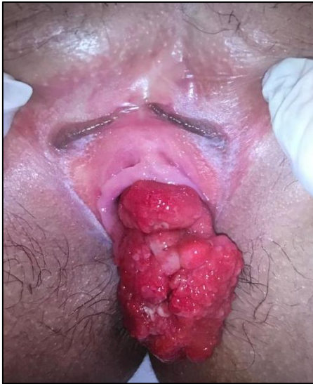
Image 1. Pedunculated lesion that protrudes through the vaginal canal

painful on palpation, protruding from vaginal introitus with a deep pedicle (Image 1).