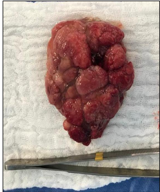
Image 3. Surgical piece

The patient underwent surgery where the excision of the vaginal tumor extending to the exocervix was performed (Image 3).