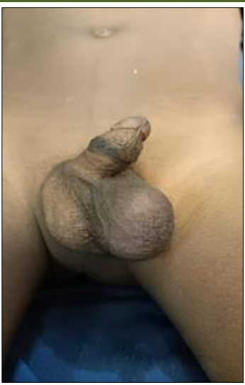
Figure 1: Patient image with left bursa tumor