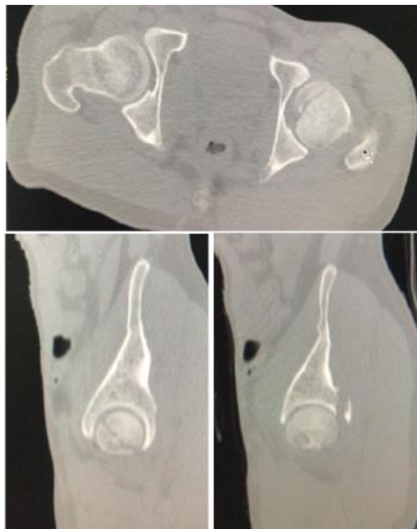
Fig-3: CT sections

The next day we opted for a surgical treatment, we approached the articulation by first approach of Kocher-langenbeck: the exploration had objectified a partial section of the pelvic-trochanteric muscles, We