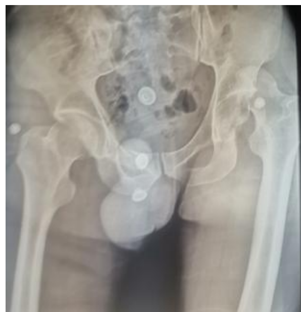
Fig-1: X-ray of the pelvis showing a Pipkin IV fracture of the femoral head

Standard radiography allowed the diagnosis of a posterior luxation fracture Pipkin IV of the left hip, the head being indented on the posterior wall of the acetabulum (Figure-1).