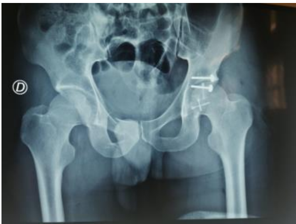
Fig-5: Post-operative pelvis x-ray

We then continued by reducing the fragment of the femoral head and osteosynthesis by 3 screw of herbert thus an osteosynthesis of the post wall of the acetabulum by two cortical screws 4,5 (Figure-5).