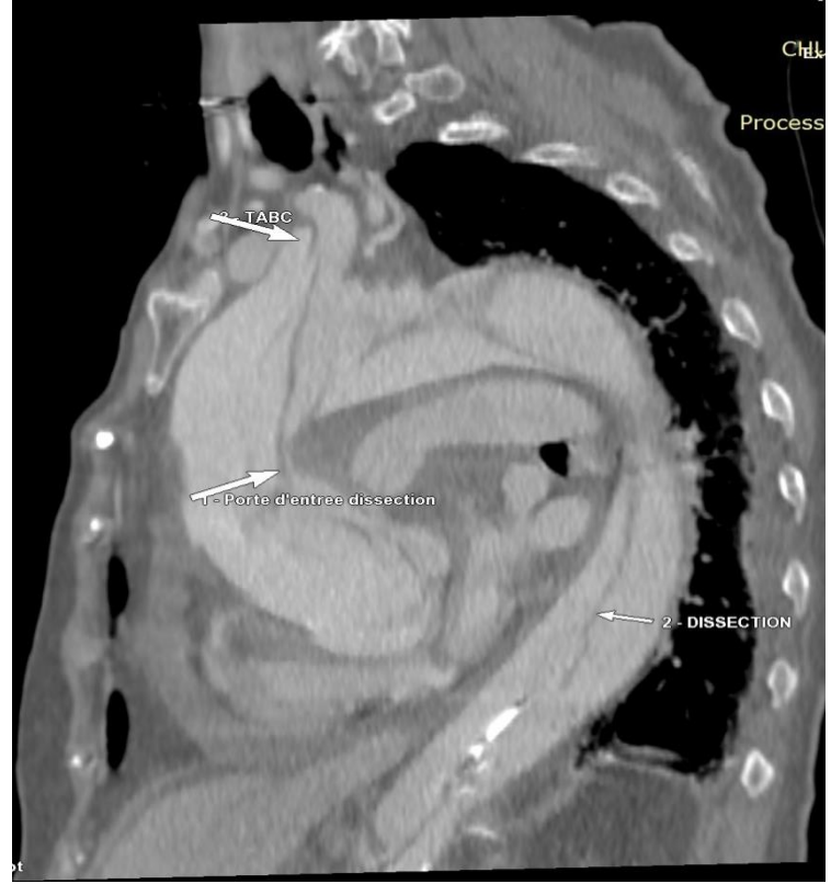
Figure 1: Sagittal section showing type A aortic dissection with extension to the brachiocephalic artery trunk (1: Entry tear, 2: Intimal flap, 3: brachiocephalic artery trunk)