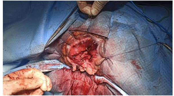
Fig-4: Manual colo-anal anastomosis