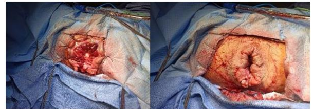
Fig-5: The final view