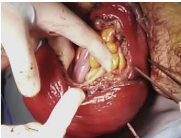
Fig-3: Recto-sigmoid résection