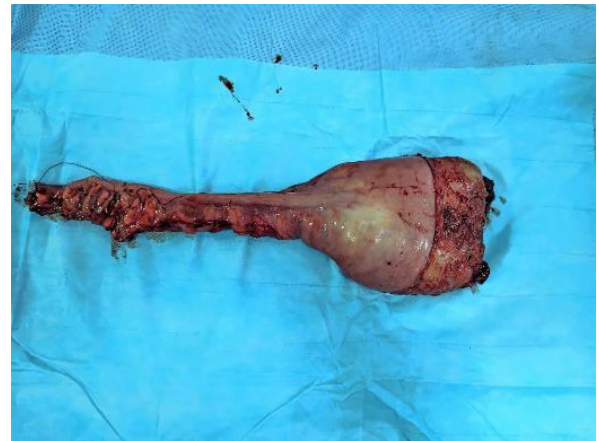
Fig-6: The operatory piece