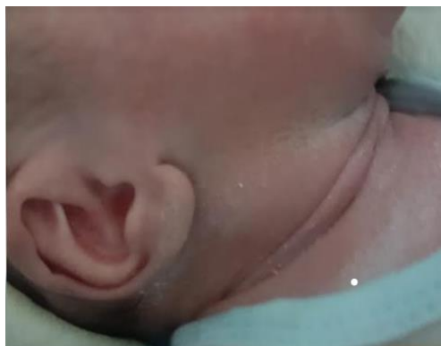
Figure 1: Mass in the right cervical region

The findings of the clinical examination as well as the ultrasonographic appearance were in favor of a fibromatosis colli.