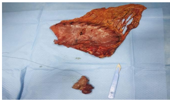
Fig-2: The surgical specimen of gastric tumor with small stromal tumor