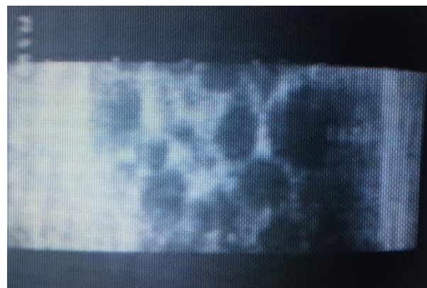
Fig-3: Ultrasound appearance suggestive of hydatid cyst

Systematic ultrasound of the swelling revealed signs in favor of hydatidosis, which were analyzed according to the Gharbi classification [4] as Type III for all patients (Fig-3).