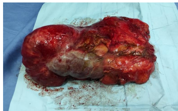
Fig-2: Macroscopic aspect of the operative part after complete resection

The patient was operated. A midline incision was made, with colo parietal detachment, allowing a single-piece resection of the mass carrying the 22x15x16cm right kidney and weighing 2101.8g (Figure 2). It was a well-limited body fat, encapsulated with planes of sharp cleavages entirely encompassing the right kidney.