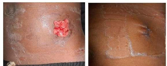
Fig-5: Non-operative treatment