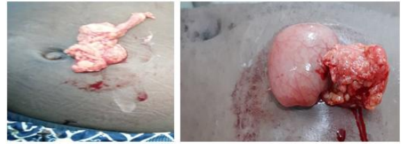
Fig-1: Epiplocele and enterocele

The non-operative treatment "selective abstentionism" (Cf. fig 5) was observed in 38% (25) of the cases, the selection of the patients was based on a certain number of criteria: a simple wound with or without epiplocele, without flow of stool or digestive hemorrhage through the wound, after this selection a protocol of follow-up was elaborated in the service and a strict monitoring "armed expectation" (Cf. table 2). The failure of the non-operative treatment was 8% (1 puncture wound of the stomach, 1 wound of the right colonic angle), the operative gesture was the simple suture. The morbimortality of the non-operative treatment was nil.