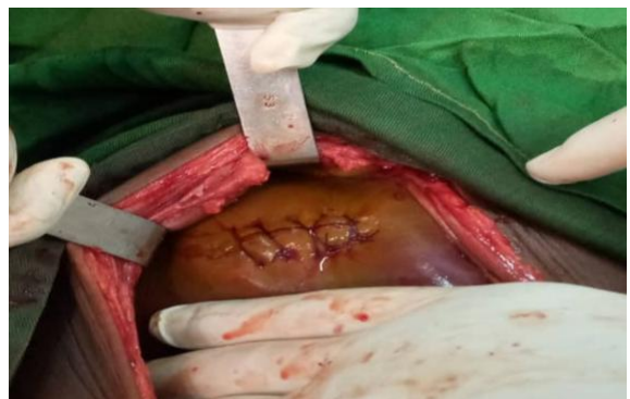
Fig-4: Sutured liver wound