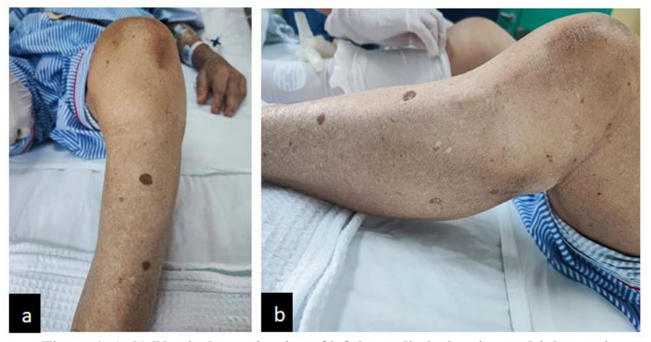
Figure 1: (a-b) Physical examination of left lower limb showing multiple naevi

found intraperitoneally. 50cm of small bowel was resected with a primary end to end anastomosis. He was discharged on day 5, once feeding was established. Histopathological examination (HPE) of the bladder and small intestine tumours were malignant melanoma, however unable to point out the primary lesion. He was counselled for adjuvant therapy, however he refused. He remained well during follow up with no new complaints.