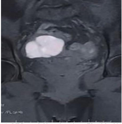
Figure 1: (MRI) revealed hyperintensity on T2-weighted imaging

The patient did well after surgery, was discharged 5 days after surgery, and is presently included in our follow-up program, which consists of alternating abdominal ultrasound and CT scans every 6 months for the next 2 years.