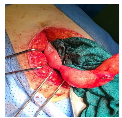
Figure 2: Peroperative view