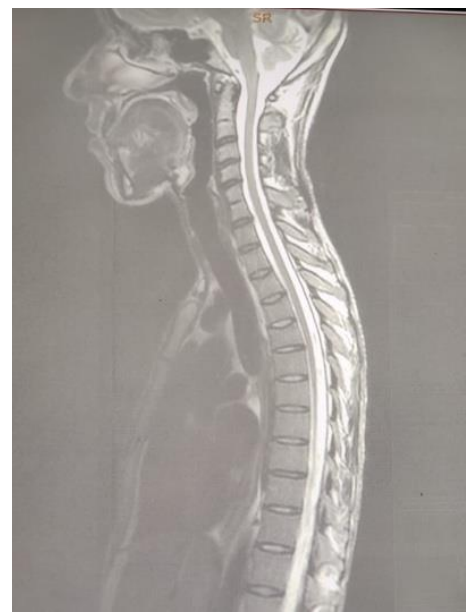
Fig-6: Vertebral MRI: after 3 months, shows vertebral hemiblock of L5-S1