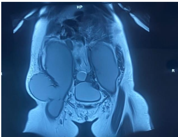
Figure 2: Abdomino-pelvic MRI showing bilateral iliopsoas muscle collections