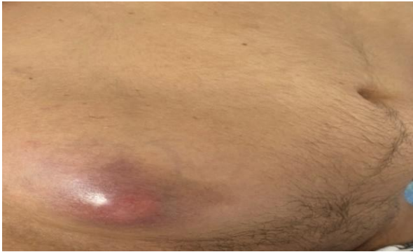
Figure 1: Image showing the right iliac fossa mass at the pre-skin fistulization phase