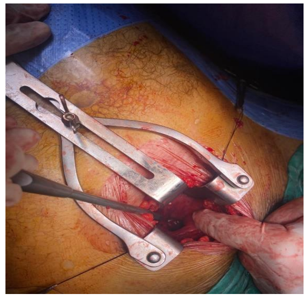
Figure 1: Bladder approach, exposure of the Retzius space, bladder opening, placement of the Hryntschak retractor

a) A suprapubic skin incision was made using a scalpel. The aponeurosis of the rectus abdominis muscle was opened, followed by the separation of the rectus muscle. b) The Retzius space was opened, the anterior bladder wall was cleared of fat, and the anterior wall was exposed.