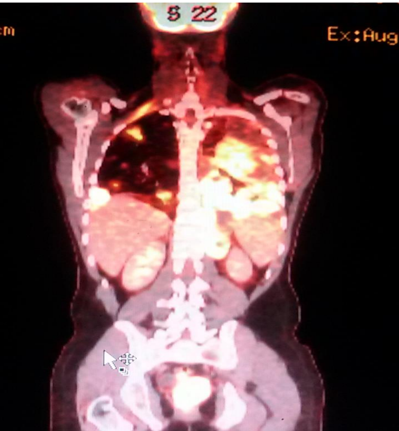
Figure 1: PET scan at time of presentation.

The patient was started on chemotherapy within one week of diagnosis, now after six months he has dramatic response (Figure 2).