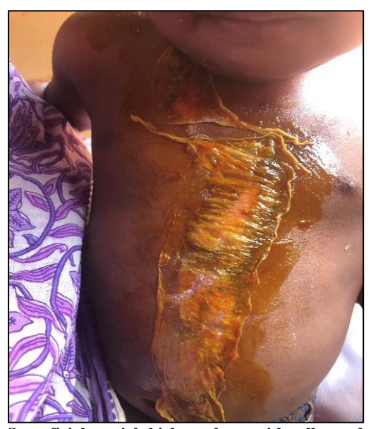
Fig. 3: Superficial partial thickness burn with collagen dressing