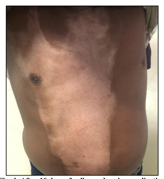
Fig. 4: After 10 days of collagen dressing application