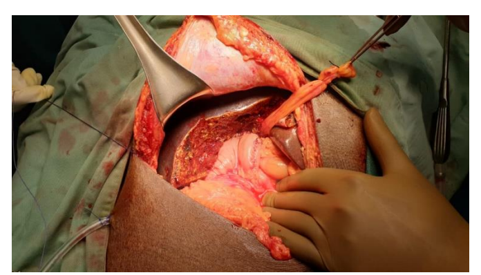
Fig. 1: Gall bladder wall thickness measurement in millimeters with help of a digital Vernier calliper

Statistical analysis was performed using SPSS version 26 software. Categorical variables were presented as frequencies and percentages, while continuous variables were presented as means and standard deviations. The association between categorical variables was analyzed using the chi-square test, and the difference between continuous variables was analyzed using the student t-test. The receiver's operating curve (ROC) was done to find out the cut-off value. Diagnostic accuracy was measured by calculating sensitivity, specificity, positive predictive value, negative predictive value, and accuracy. A significance level of 0.05 was used for all tests.