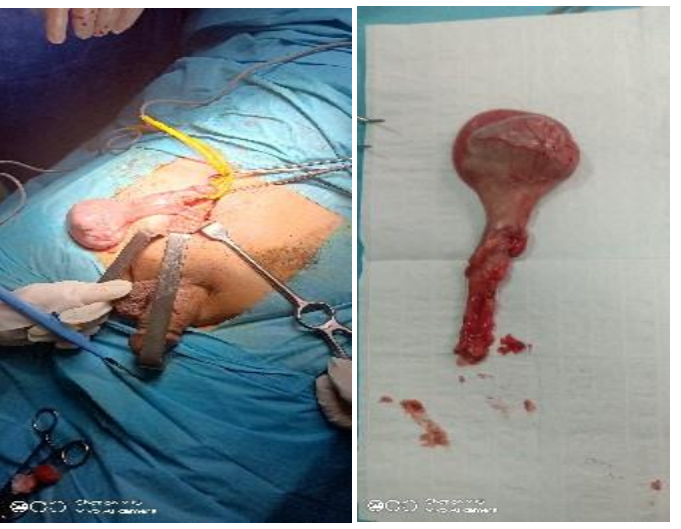
Fig-1: Intraoperative and orchidectomy image

The Schiller-Dival body visible on the histology of the piece, suggesting the viteline tumor.