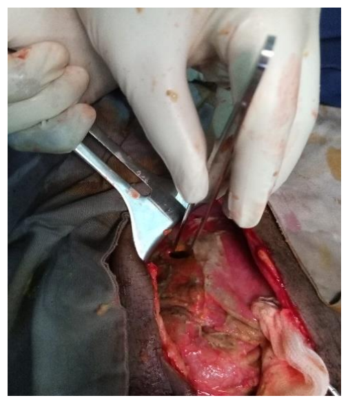
Figure 3: Duodenal perforation hole indicated by dissection forceps