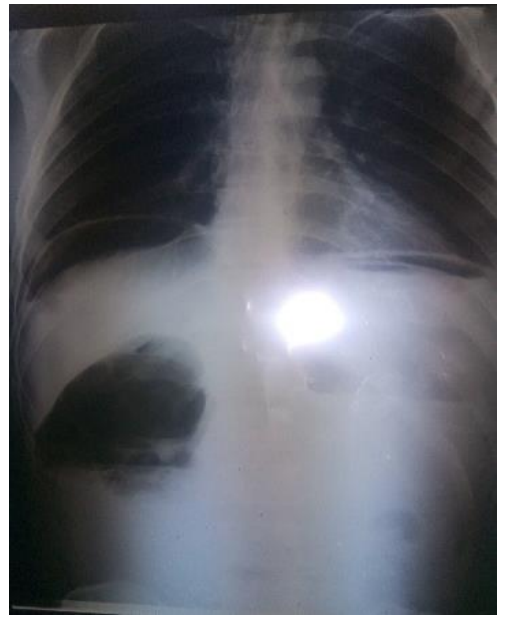
Figure 1: PSA: presence of pneumoperitoneum

Blood count, blood glucose and creatinine levels were normal. Ultrasound examination revealed a large intraperitoneal effusion.