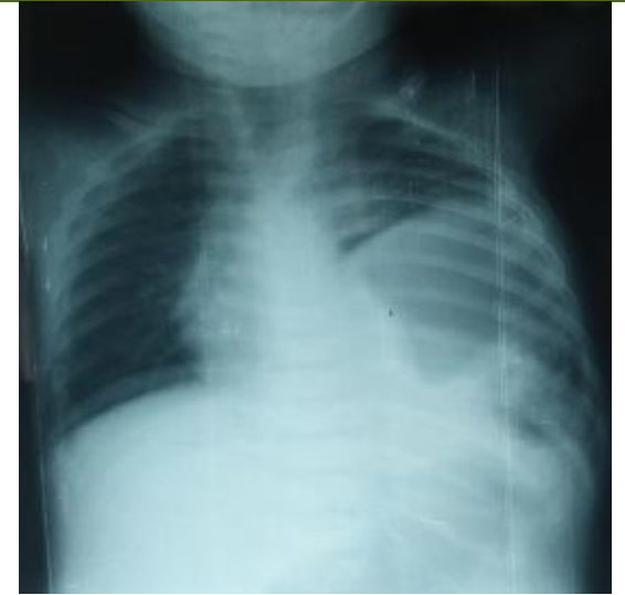
Figure 1: Preoperative chest X-ray