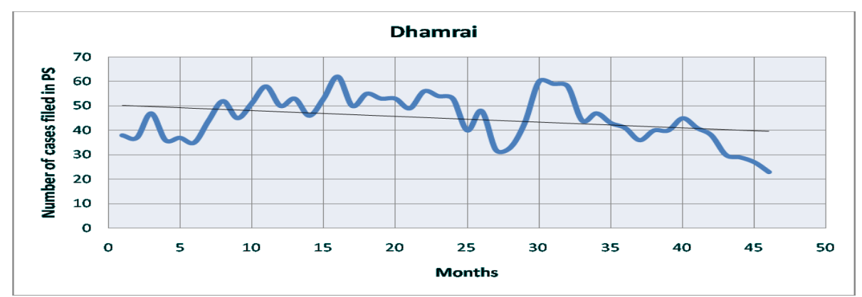
Fig-3: Dhamrai police station crime index