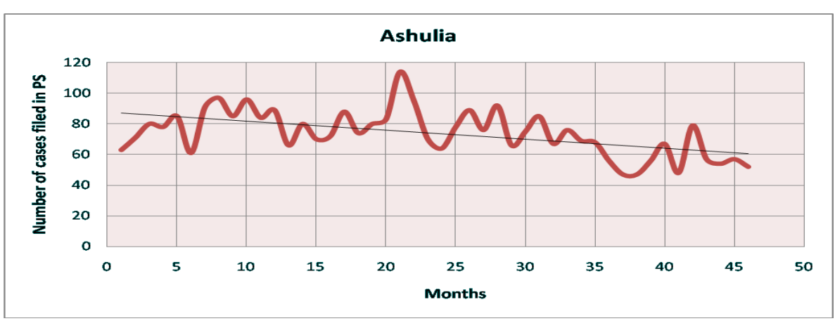
Fig-2: Ashulia police station crime index