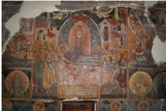
Fig-9: Fresco in St. Mary of Blachernae Church (1578)

Characteristics of Nicholas of Onouphrios works are the images with prolonged proportions, differentiated from the portrait, the loose outfits with rolls, decorative colours and the ethnographic element. Nicholas is the author of the paintings in St. Mary of Blachernae Church ( Fig. 9 ), at the Castle of Berat (1579) and of a series of icons of Berat. Also, he has painted the frescoes of churches: St Nicholas in Kurjan, Fier and St. George in Arbanasi, Bulgaria (1561).