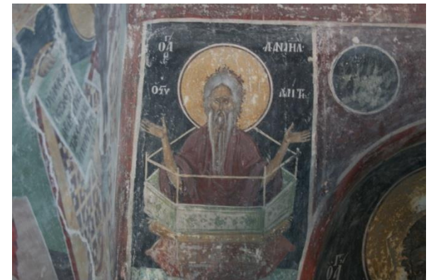
Fig-8: Fragment of a fresco in St. Theodore's church, Berat (1555)

The scenes of feast icons are massive, but organised in a perfect way in order to serves the biblical theme and the form of creation is special. In the single image icons which he creates for Berat's iconostasis, appear also other qualities of the master where above all is noticed the influence it has upon him the Palaiologos style (1261 - 1453) and the iconographic school of Crete with Venetian influence.