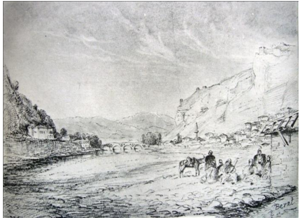
Fig-1: Georges Stockli: Berat city (drawing, 1818), Mihalarias Art Center, Athens, Greece

Of course the number of the city quarters was inconstant because even the concept about their size and extension was variable. In the documentation of that time are found written down the main quarters as well as derivates of secondary quarters.