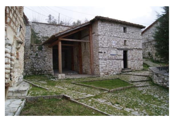
Fig-3: St. Nicholas church

St. Nicholas's church (Fig. 3). The archaeological excavations have discovered that the walls of the church have been constructed in the XVI century. This is proved even by the inscription of the year 1591 which is located in the frescoes of the northern gate. The church has a rectangular plan and is composed by the naos, the alcove of the shrine and threefacet abside. In the church there is a reused capital as a shrine about religious servings, which is an element of the Paleochristian architecture. The church is painted by Onouphrios Cypriot^2 ). In the upper part, under the construction of the roof is painted the line of prophets. In the second line are painted evangelical scenes. In the lower line are painted the martyrs and the apostles. In the sides of the church exist two parts of ruined paraclises, one of which hold the name of St. Anastasius and the other that of St. Athanasius.