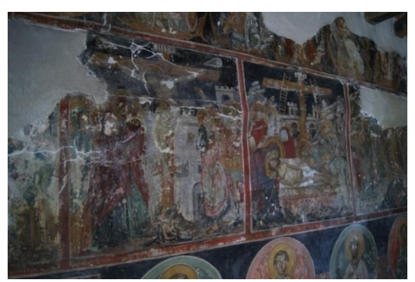
Fig-11: Frescoes in the St. Nicholas church (1591)

Epilogue, the development of art in Berat (Fig. 12) in the centuries of the Post-Byzantine period: a panoramic overview. Gradually, in the end of XVI century, the city life in Berat became more vivid and developed. According to Zija Shkodra, a famous scholar. Berat had in the beginning of this century 572 families, and by the year 1570 [i.e. the end of the XVI century / 11. Shkodra 1973: 32] the city had grown larger with 1050 families. This enlargement continued rapidly a century later by holding the first place in Albania as the largest city with 5 thousand houses covered with tiles,... beautiful and adorned like the best places of paradise..., and inside the wall of castle there were 200 houses covered with tiles... [3. Celebi 2000: 45]. The city continued to function as a metropolis [13. Papa 2001: 64]. The number of population grew even more with the demographic movements of 1769, when there were turmoils in the city of Moscopole (Voskopoja) and the villages around. During this time began the investments for the new churches with great dimensions and with inside decorations covered with frescoes and icons. Together with numerous buildings of the Islamic cult, according to Çelebi, Berati had 30 Islamic shrines... [3. Celebi 2000: 50], show that the city thrived economically and socially during the XVII - XIX centuries.