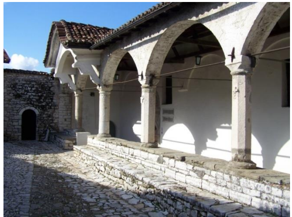
Fig-5: St. Mary's Assumption Cathedral

The most important monument of the Christianorthodox cult in the city of Berat is represented by St. Mary's Assumption Cathedral (Fig. 5). Different from the other churches of this time, the cathedral is distinguished as a building with bigger dimensions. The building has existed for at least, since the XVII century, until Evliya Çelebi in 1670 testifies that in the outer part of Berat castle "there are 8 churches amongst which, one of them is bigger and more beautiful" [3. Çelebi 2000: 45]. From the description of the traveller Çelebi, we understand that he is referring to the Cathedral.