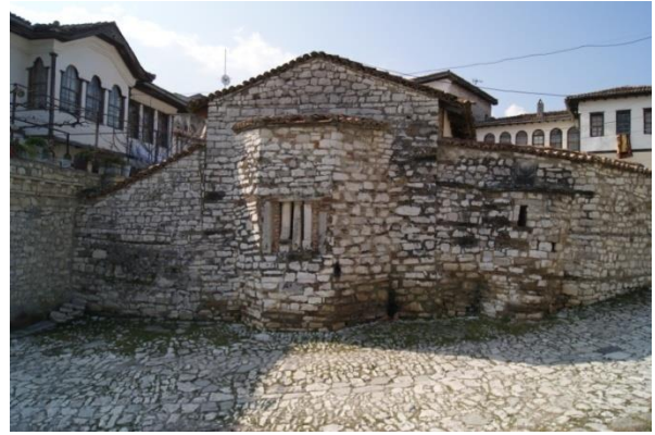
Fig-2: St. Theodore's church

St. Theodore's church (Fig.2) is near the entrance of the Castle. According to the evidences discovered during the restoration, the existing construction is constructed upon the foundations of an old church, around the middle of the XVI century. It is decided upon this date, because in its walls are present fragments of frescoes by the master Onouphrios, where is written the year 1555.