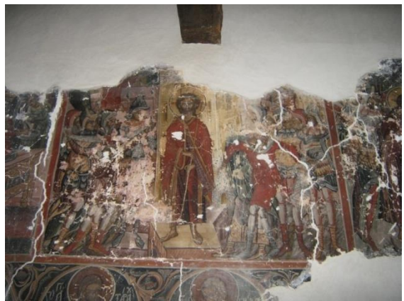
Fig-4: Fresco in church of St. Demetrius (1607)

In the Eastern part of the quarter is church of St. Demetrius (Fig. 4), which is reconstructed by the end of the XVI century and the beginning of the XVII century over the ruins of an old church. The date of the painting is presented over the inscription of the paintings where is written the year 1607. The church represents a low building, situated on the side of one of the longitudinal roads of Castle quarter. Throughout time the church has undergone several repairs which can be concretically observed even in the construction and enforcement in the internal of the porch in the Southern part (1774).