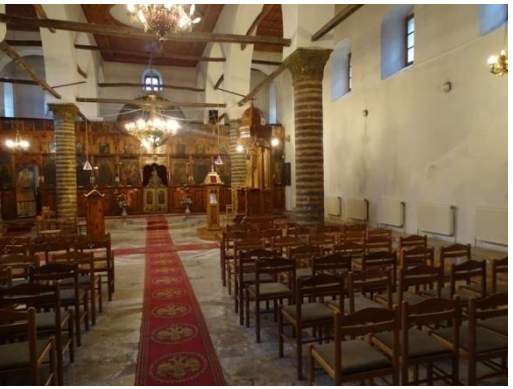
Fig-6B: Interior of St. Spyridon church