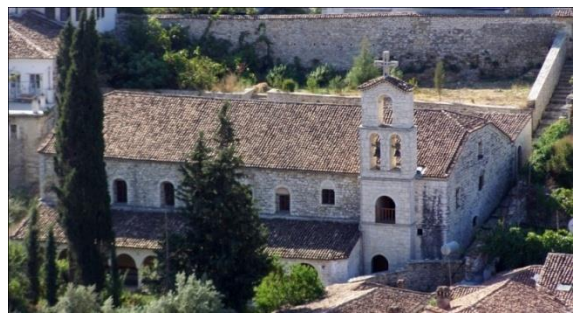
Fig-6A: St. Spyridon church

The constructions of the orthodox cult were expanded even in Gorica ( small hill ) quarter. There existed and functioned Saint Spyridon church (Fig. 6) . We do not have any information regarding the time of its constructions or other architectural characteristics, except the fact that we are convinced for its existence since at least the XVIII century by the testimony which proves that the church was reconstructed in the year 1864, as it is shown by the inscription at the entrance of the church.