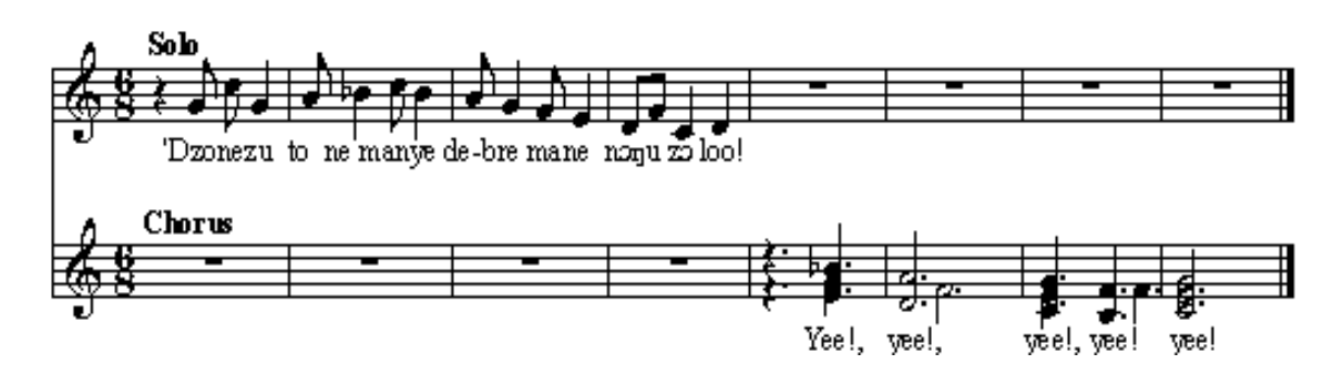
Example 3: An agbleha with a theme of love.

'Dzonezu to, manyedebre Mane nɔ 'ŋuzɔ loo! Yee! yee!, yee!, yee! yee! Adzobado loo!