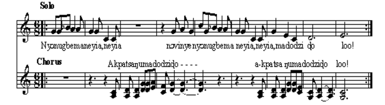
Example 1: An agbleha inspiring divorced male farmers to take heart and work hard.

The text of an agbleha below depicts how a farmer consoles himself instead of brooding over loneliness and a sad psychological state of mind created by the absence of his divorced wife: Nyonugbemaa, neyi (Let the woman who has divorced me, go).