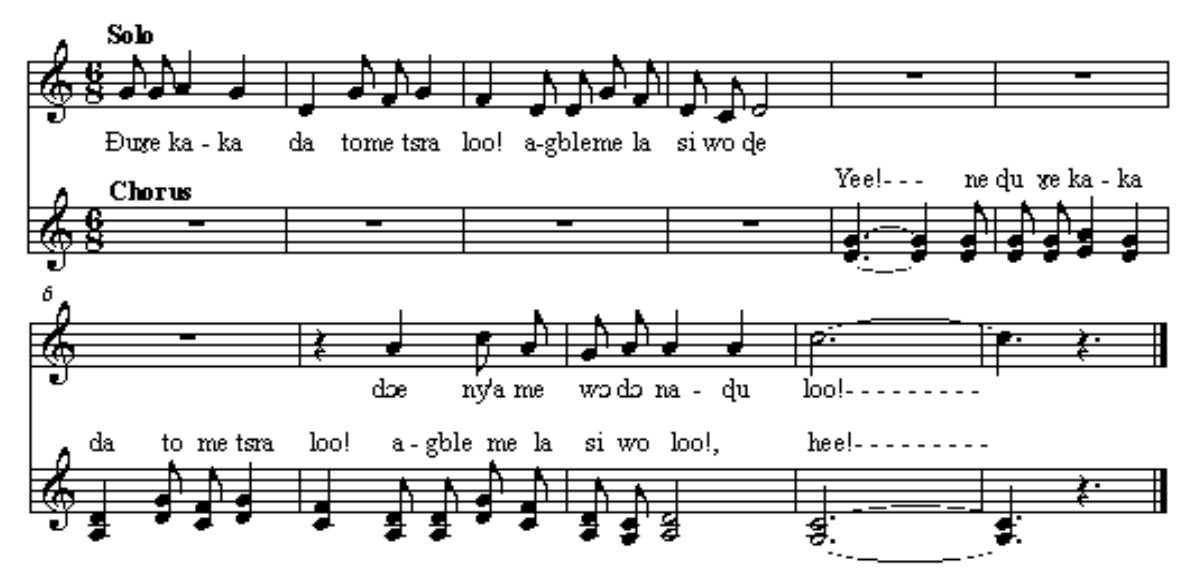
Example 2: An agbleha ridiculing lazy youngsters.

Mikpsedaa, mikpsedaa //:Đure kaka da tome tsra loo!//: Agblemel'asiwo loo!:// Migblsna Kwadzo<sup>1</sup>nebsbs Migblsna Yawa<sup>2</sup>nebsbs //:Đure kaka da tome tsra loo!//: Agblemel'asiwo loo!://