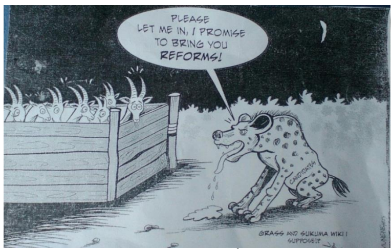
Fig. 3 (From The Standard of 6<sup>th</sup> February, 2013)

In Fig. 3, a narrative representational illustration is used. There are goats in a wooden pen and it is dark at night as heightened by the crescent moon in the dark sky. In the cartoon illustration still, there is a big hyena salivating with its tongue extended towards the goats. The hyena bears the labeled 'candidates' -referring to political candidates for the then forthcoming general elections. The tongue of the hyena and legs extend towards the goats form a vector connecting the hyena, actor, to the goats, goal. The words 'please let me in, I promise to bring you reforms!' express a plea for acceptance by politicians to the voters -represented by goats in a wooden pen. This connotes the distance or void that exists between the voters and the political candidates who are presented as greedy - salivating with the intent of wreaking havoc on the voters. A nondescript creature at the bottom of the frame makes a comment that expresses its disbelief in anything good from the hyena when it says 'grass and sukuma wiki suppose!?' This illustrates that the Kenyan political candidates cannot have anything good in store to offer the electorate, they can only exploit them and pursue the posts through persuasion for their own personal ends.