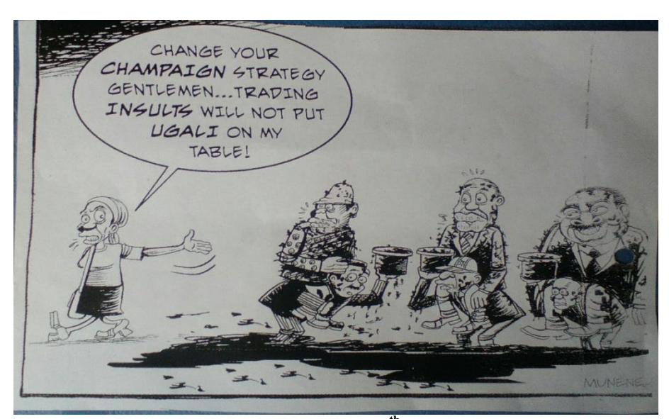
Fig.1 (From the Standard of 30th January, 2013)

The cartoon illustration in Fig.1 alludes to the Kenyan politicians' habit of calling each other names in election campaign forums, a trend rampant in Kenyan politics.