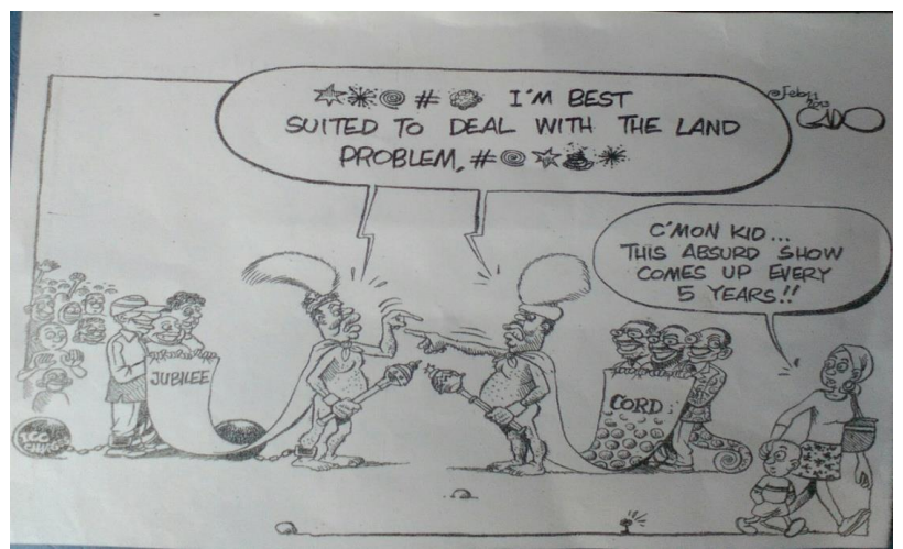
Fig. 6 (From Daily Nation of 11th February, 2013)

Fig. 6 The cartoon illustration presents Uhuru Kenyatta of TNA party, Jubilee Alliance and Raila Odinga, ODM, CORD Alliance who were both presidential candidates, and their associates in the 2013 general elections.