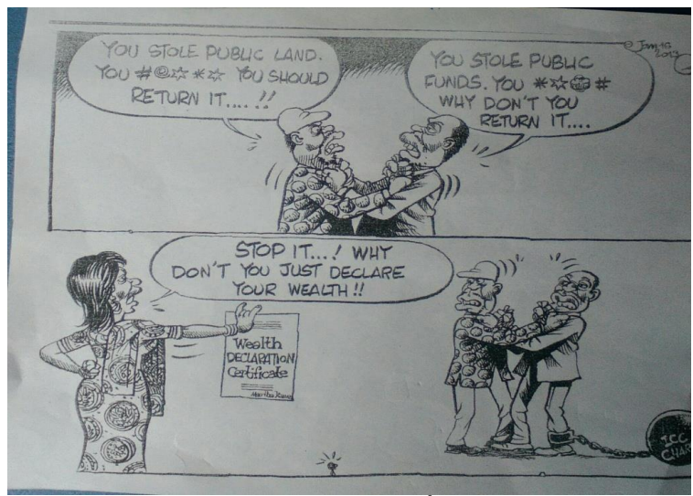
Fig. 4 (From Daily Nation of 16th January, 2013)

Fig. 4 uses a narrative representational structure kind of representation. In the upper panel of the text, two presidential aspirants, Raila Odinga on the left and Uhuru Kenyatta on the right are fighting, throttling one another and calling each other unprintable names. Their hands form vectors connecting them. In this case, Raila is an actor and a goal at the same time. Uhuru is also an actor and goal. This means that they are people of equal standing and character in the Kenyan political scene. In the lower panel there is a lady on the left who advises them to stop the fight and instead declare their wealth to settle their dispute reasonably. To the right of the lower panel are still the two locked in a fight but on hearing the voice of the lady, they look in her direction. This seems to be the only voice of reason. Tagged to Uhuru's left ankle are the International Criminal Court (ICC) charges over 2007/2008 post election violence. In the lower panel, the lady is the actor. She is the participant from whom a vector emanates. Her right hand forms a vector connecting her to the goal, the two presidential candidates, Uhuru Kenyatta and Raila Odinga.