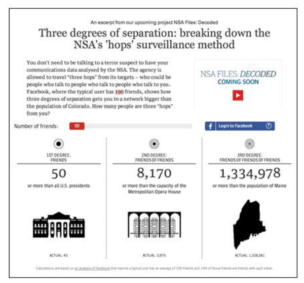
Fig-2: An interactive infographic example from The Guardian Newspaper [16]

city and country population for each hop.