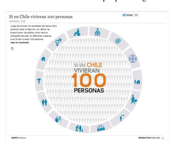
Fig-4: An example from the La Tercera newspaper website published in Chile [18].

In the final example, an example was taken from La Tercera, a newspaper based in Chile, which frequently used interactive storytelling and infographics in news presentations (Fig-3). In these infographics, the demographic information, such as education, health, religion, the number of the disabled people, the number of the employed people have been presented by exemplifying on a hundred people with regard to the people living in Chile.