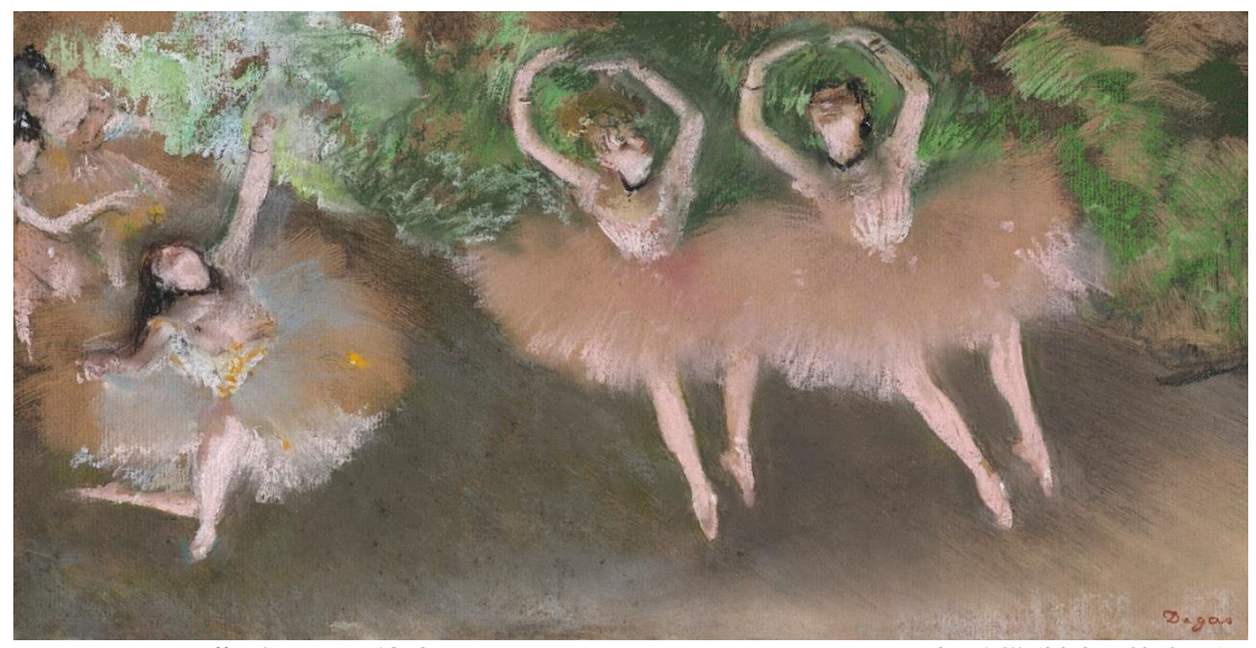
Fig-4: Edgar Degas. Ballet Scene. c. 1879. Pastel over monotype on paper, plate: 8 x 16" (20.3 x 40.6 cm). William I. Koch Collection

At the end of the 19th century, the leading artists of monotype printing were Frank Duveneck, Willam Merrit Chase, Charles A. Walker and Maurice Prendergast. The first three artists were American who