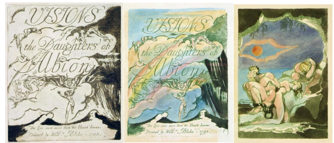
Fig-2: William Blake, Monotype Press, 7.3x11.7cm, 1793

prints for the pictures of the poetry book "Visions of the Daughters of Albion" published in 1793.(Fig-2) He is one of the important artists who achieved successful painterly effects in illustrations by using different painting techniques. He printed using oil and egg tempera on cardboard or copper plates. Also, Blake accomplished mysterious results by applying watercolors and ink on his prints [12].