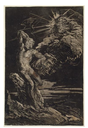
Fig-1: Giovanni Benedetto Castiglione, The Creation of Adam, Monotype Press, 30x20.5cm, 1645

well adapted to monotype printing technique. Most of his canvas paintings were created with light colors on a dark background. Castiglione's paintings and monotype prints with dark backgrounds are largely depictions of night scenes that are illuminated by a handheld light or a mystical holy light. His extant works are mostly about religious issues. "The Creation of Adam" as an illustration was made to remind that the primal darkness in the world was enlightened by god [10].