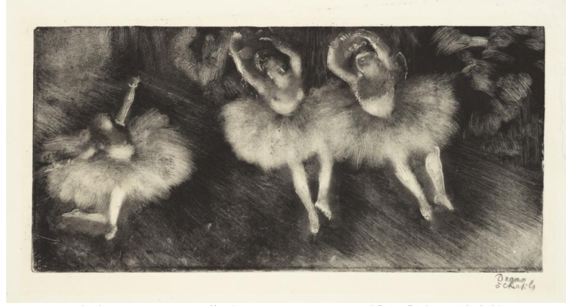
Fig-3: Edgar Degas, Ballet Scene, Monotype Press, 35,6 x 51,3 cm, 1878-80

to construct the infrastructure for lithography and pastel work in accordance with the pictorial character of his works, which are dominated by black ink, gouache and pastel paint (Fig-4) [13]. Degas also recognizes that monotypes can grasp the essence of modern life. One of the most remarkable monotypes of Degas, "A Man and a Woman's Heads," shows the faces of a couple in an amorphous way and out of focus. This gives us a chance to understand the characteristics of a person who spends everyday life in "stream of consciousness" [14].