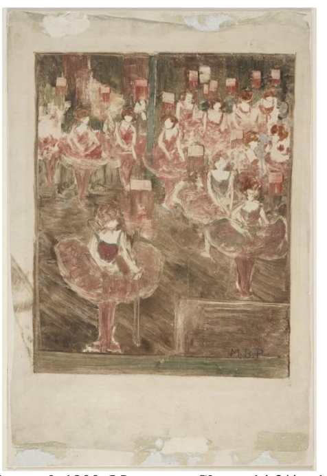
Fig-5: Maurice Prendergast. The Rehearsal. 1900. Monotype, Sheet: 14 3/4 x 10" (37.5 x 25.3 cm). The Museum of Modern Art, New York. Abby Aldrich Rockefeller Fund, 1945

Milton Avery's textured color field landscape studies. It was inevitable for these artists to choose the monotype technique to capture the mass culture, the elements of entertainment and the rush in the city [16].