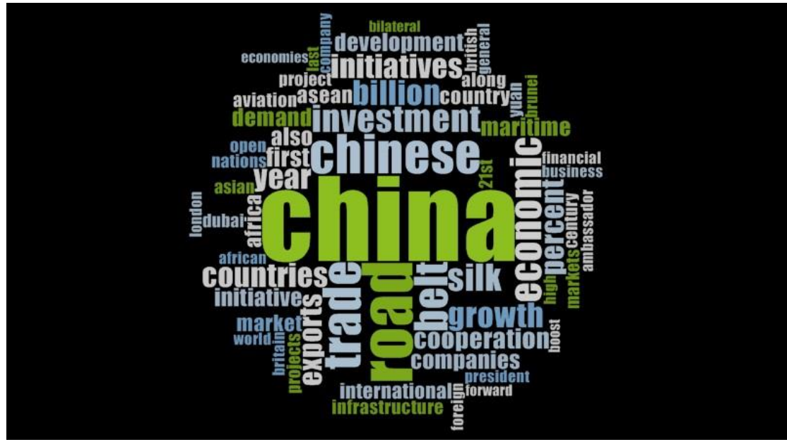
Fig-2: Word cloud of ChinaDaily reports by NVivo Word Frequency Query