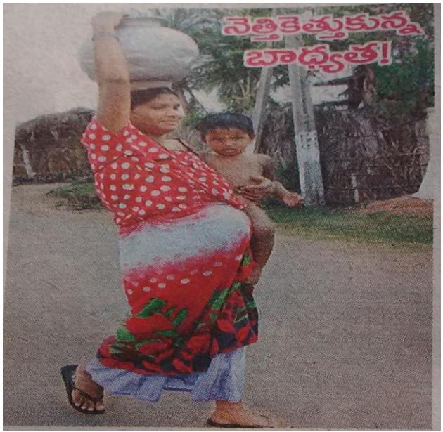
Fig-1: The newspaper reports a real story of the poor woman on the very next day of Women's Day, i.e. on March 8th!

There is no wonder when the poor women try to sell their milk, naturally there will be number of buyers. The pictures below are taken from local newspapers that reflect the sympathetic condition of Indian women.