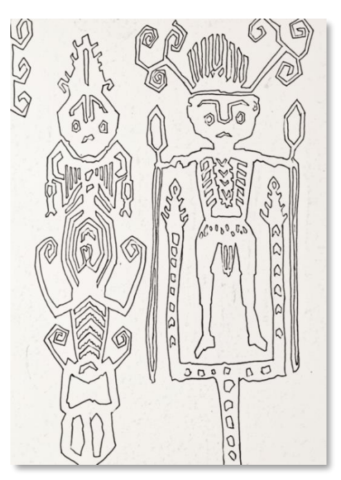
Fig-3: Engkaramba Motif

Traditionally, the Pua Kumbu is used in the ritual ceremonies related to God, Goddess or Deities. Today, the usage of Pua Kumbu textile has changed. It is now become more for decorative accessories, as a piece of art work displayed on the wall, table cloth, beg and other newly invented artwork solely for decorative usage. This is merely to promote tourism in Sarawak. Among the evolution of the Pua Kumbu textile is now used as modern apparel in fashion such as scarf, clothes, headband, and skirt, dress and head gear. If we were to