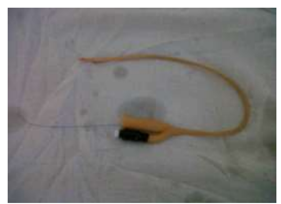
Figure 1. Size 8 Foley catheter with stylet