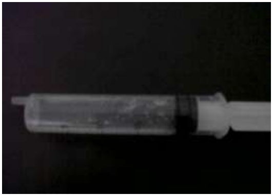
Figure 4. 20ml Syringe just after vigouros shaking with micro-bubles