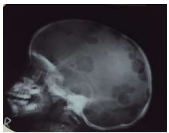
Fig.4: Radiograph skull-lateral view.Multiple,lytic lesion with non-sclerotic, scalloped margins with a maplike configuration- 'Geographical skull'