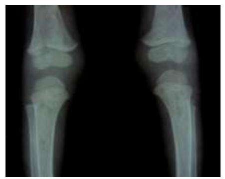
Fig.1:Radiograph of bilateral knee-A.P. view.Lytic lesions with non-sclerotic,scalloped margins in metaphysis of lower end femur and upper end tibia.

showed multiple,lytic defects in long bones with endosteal scalloping-described as 'hole-within-hole' appearance(Figure-5). X-ray Chest showed lytic lesions affecting multiple ribs(Figure-6). On basis of characteristic osseous lesions a diagnosis of Langerhans cell histiocytosis was made.