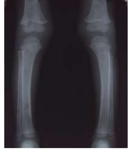
Fig.2: Radiograph bilateral leg-A.P.View. Lytic lesion with scalloped margins meta-and diaphysis of bilateral tibia.