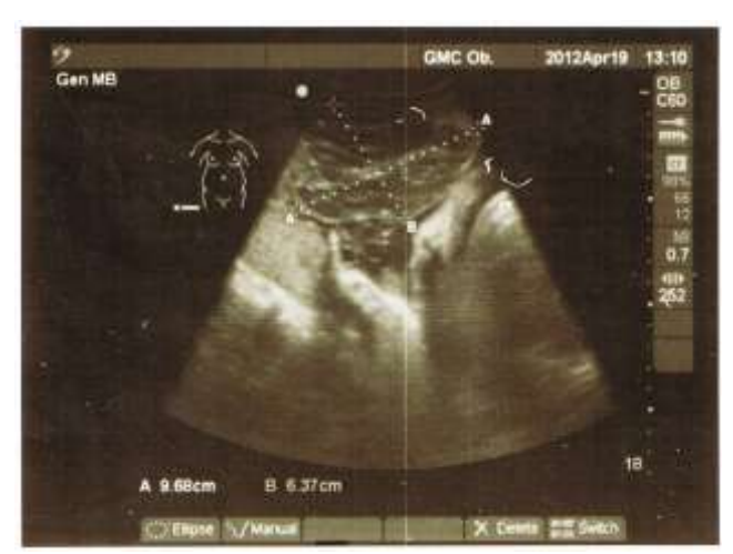
Fig. 1: An irregular growth of size 9.6cm×6.3cm with blood flow pattern consistent with chorioangioma

She presented at 33 weeks of gestation with pain abdomen. On examination the abdomen was tense and fundal height was 4 weeks more than the period of gestation and there were moderate contractions. An ultrasound scan revealed that fetus was in breech position. Fetal biometric parameters were equivalent to dates and no gross fetal anomalies were seen. The placenta was posterior upper uterine segment. An irregular growth of size 9.6cm×6.3cm with blood flow pattern consistent with chorioangioma found on it (fig. 1). Liquor amount increased with amniotic fluid index of 25. Fetal echocardiography revealed mild tricuspid regurgitation. Blood sugar levels were normal.