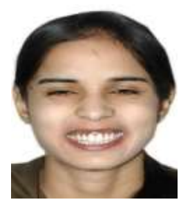
Fig.5: Post treatment and retention after 3 months & post treatment intra oral and extraoral smile photograph