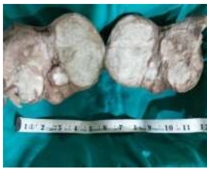
Fig. 3: C/S Obliterated endometrial cavity with multiple leiomyomas measuring 12cm in largest diameter

Multiple gray white glistening areas with interspersed white areas. Multiple sections were taken. Microscopic examination of two leiomyomas revealed islands of mature hyaline cartilage covering >95% of mass, interspersed with intersecting fascicles of benign spindle cells with abundant cytoplasm (Fig. 4& 5).