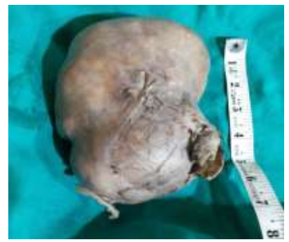
Fig. 2: Gross: hysterectomy specimen with bosselated surface ( 6x5x8cm) in diameter with congested blood vessels

Received bulky uterus with bosselated surface measuring 6x5x8cm, (Fig. 2) cut section shows multiple fibroid obliterating endometrial cavity. Cut section of fibroid had glistening gray white with whorled appearance and gritty sensation on cutting (Fig. 3). No area of necrosis or hemorrhage noted.