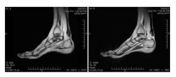
Fig.7: MRI confirmed disruption of the tendon on T1 weighted and intratendinous generalized increased signal intensity on T2 weighted

We operated on both the ankles at an interval of 2 months. We used Krackow's technique with ethibond as the suture material (Fig. 8). Post operatively above knee cast was applied for 2 weeks in equinus, suture removal done on 14th day. Short leg cast for next 2 weeks. At 4-6 weeks, gradually foot is brought to plantigrade position and partial weight bearing started. At 6-8