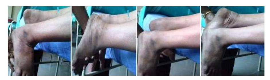
Fig. 4: Needle placed 10 cm proximal to the insertion of the tendoachilles does not move on plantar and dorsiflexion

Fig. 3: No plantar flexion on squeezing the gastrosoleus muscles, indicates that discontinuity in tendoachilles