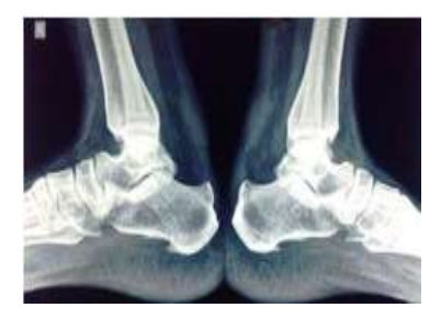
Fig. 5: ankle joints show loss of normal regular configuration of kager's triangular space, which is between the superior aspect of the calcaneum and anterior aspect of tendoachilles