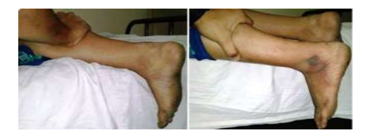
Fig. 3: No plantar flexion on squeezing the gastrosoleus muscles, indicates that discontinuity in tendoachilles

Fig. 2: No tenderness, palpable gap in the continuity of the tendoachilles proximal to its insertion, thickening noted proximal to the gap, firm in consistency