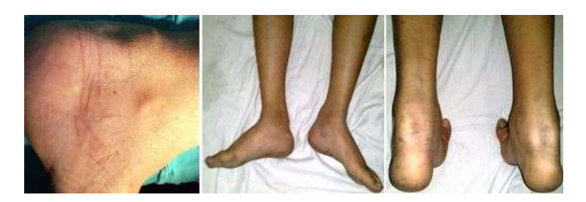
Fig.1: Subcutaneous fat was absent, visible depression proximal to the insertion of tendoachilles