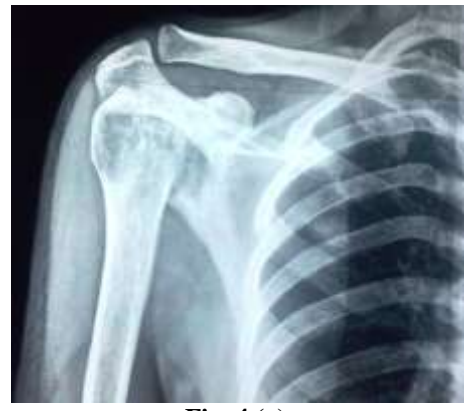
Fig. 4 (a)