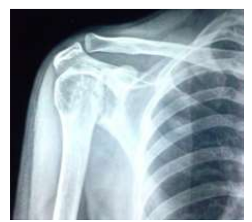
Fig. 4 (c)