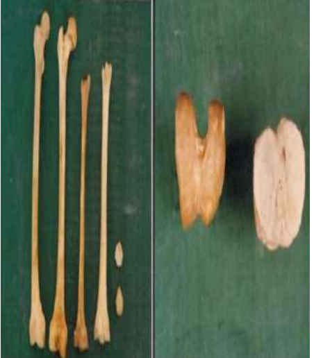
Fig. 1A &1B: Bony characteristics photography showing distal end of femur, upper end of tibia, upper end of fibula of frog and man

Patella: Osseous patella is absent in frog. A large thick and well developed patella is observed in human being [4, 6].