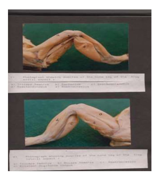
Fig. 2A & 2B: Photograph showing muscles of hind limb of the frog