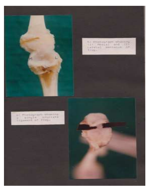
Fig. 4A & 4B: Photograph showing (4A) mensci and (4B) cruciate ligament of frog