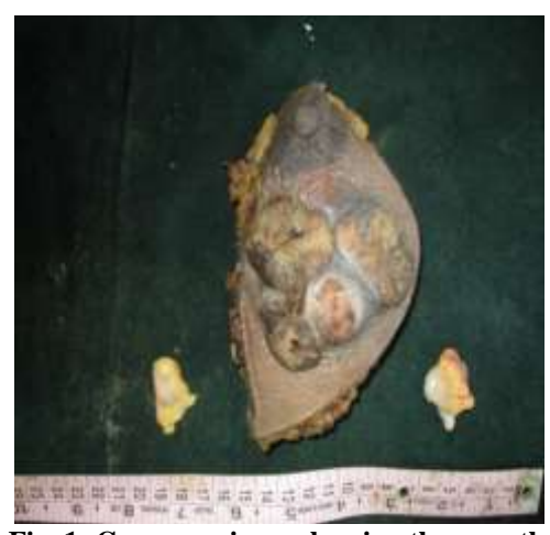
Fig. 1: Gross specimen showing the growth

tumor was triple negative. Post-operative period was uneventful and patient was referred to higher centre for chemo-radiation.