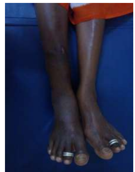
Fig. 6: Clinical Photograph at Six months