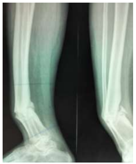
Fig. 1: Pre-operative X-ray