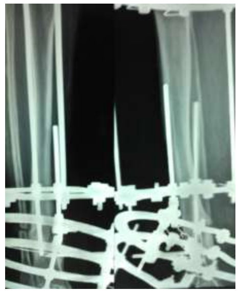
Fig. 3: Four weeks-post op