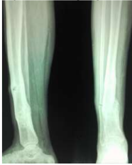
Fig. 5: Six months-post op