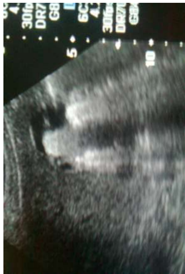
Fig. 1 showing thick walled gall bladder with multiple calculi.

Adenomyomatosis of the gallbladder is accepted to be a degenerative disease. Only one case of childhood adenomyomatosis of the gallbladder is reported in the literature [9]. Other reports show series of adenomyomatosis occurring in patients of middle age and with an incidence increasing with age, which infirms the theory of a congenital lesion [4]. Little is known about the etiology of adenomyomatosis of the gallbladder. According to the recent literature, the possible causes of the disease remain hypothetical.