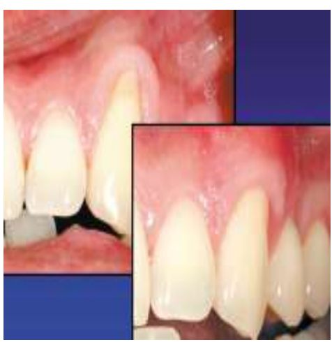
Fig. 1: Connective tissue graft used to cover the recession on canine