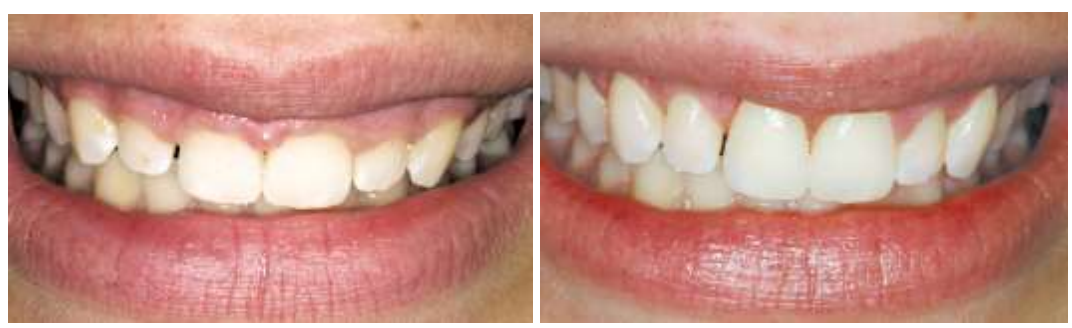
Fig. 2: Excessive gingiva removed in the process of crown lengthening to enhance the smile