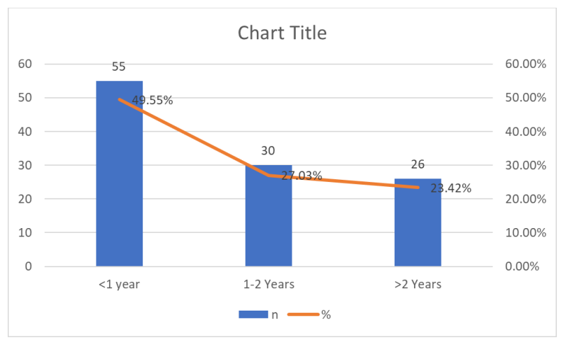
Figure 2: Distribution of cases by the duration of AUB (n=111)

abdomen, and 22.52% had a problem with defecation and micturition.